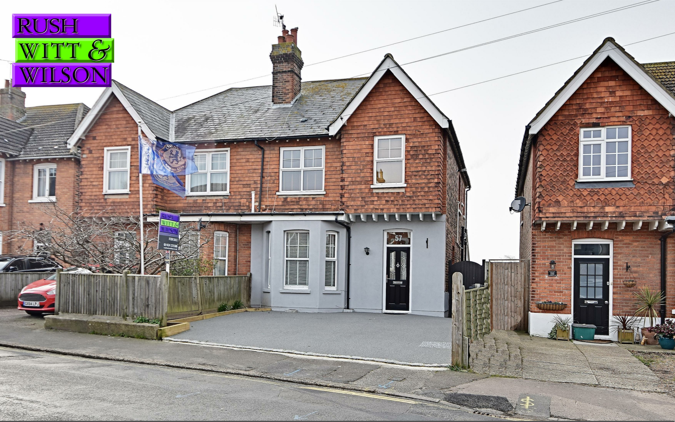
57 Holliers Hill, Bexhill-On-Sea, East Sussex TN40 2DD £349,950